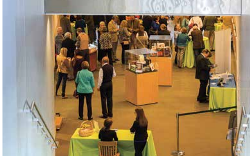
An elegant evening