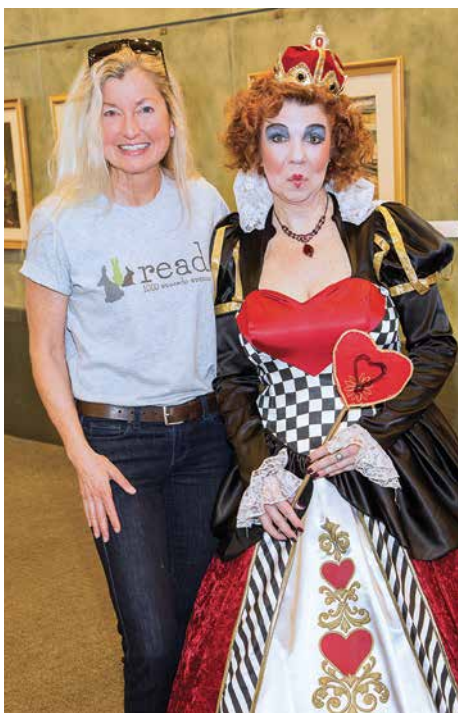
The Queen of Hearts paused for a photo at the Bunnies & Books for Kids Festival.

"Outside of a dog, a book is man's best friend. Inside of a dog, it's too dark to read." — Groucho Marx