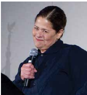
Anna Deavere Smith