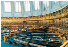
Candida Höfer: British Library London. A circular photograph. 2004/2005. 100x100 cm. 1000.